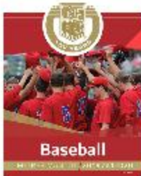
2019-20 NFHS Baseball Umpires Manual