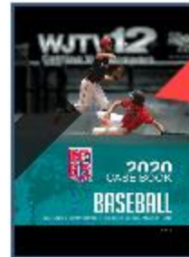
2020 NFHS Baseball Case Book