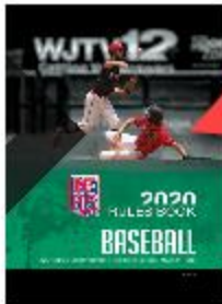
2020 NFHS Baseball Rules Book